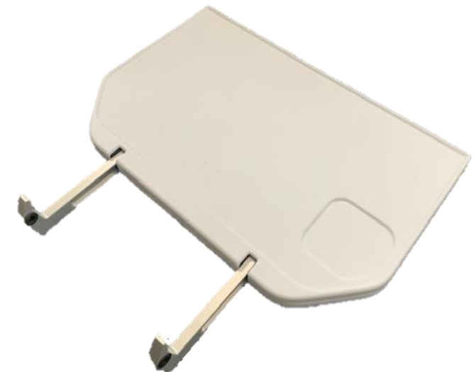
DOY Design Tray Table