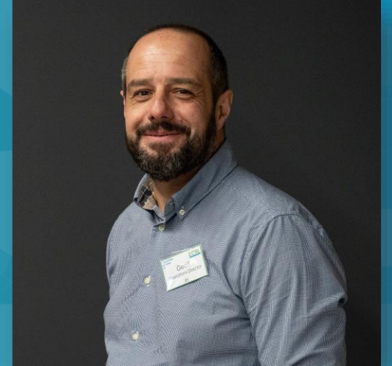
Director of Operations IES