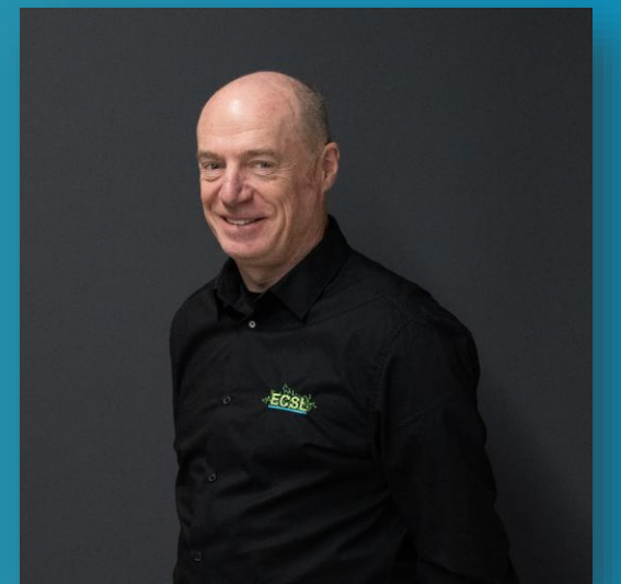
Director of Operations EC SL Ireland