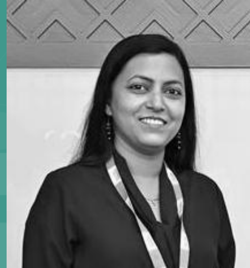
Director of Operations EC SL India