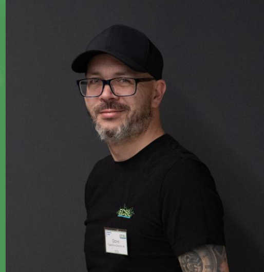
Director of Operations EC SL UK