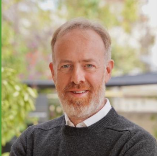
EC SL Group Managing Director